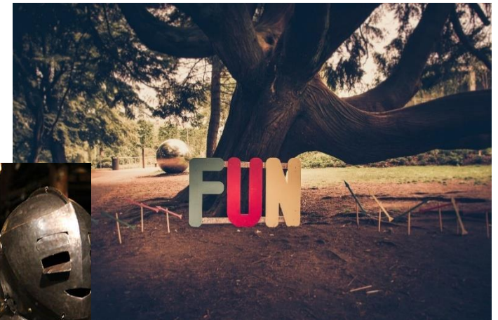
Socialize yourself II