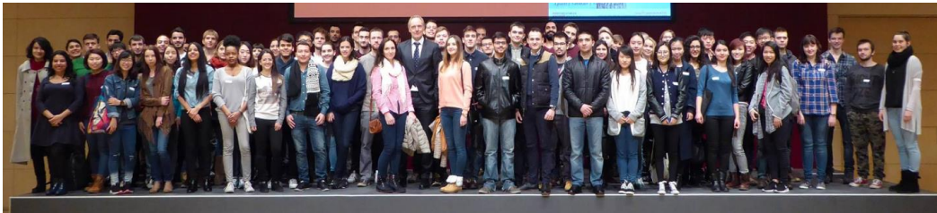
Welcome at FH JOANNEUM