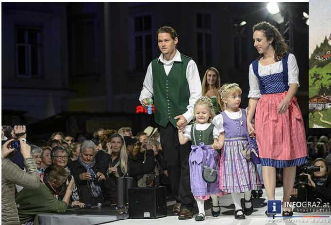
Socialize yourself I